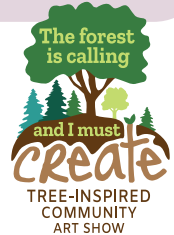
Exhibit will be on display February 3 through April 2, 2024, at The West Woods Nature Center. See page 15 for details.

Here's an idea: Frame your paintings (like we did here) and enter your work into our upcoming community art show!