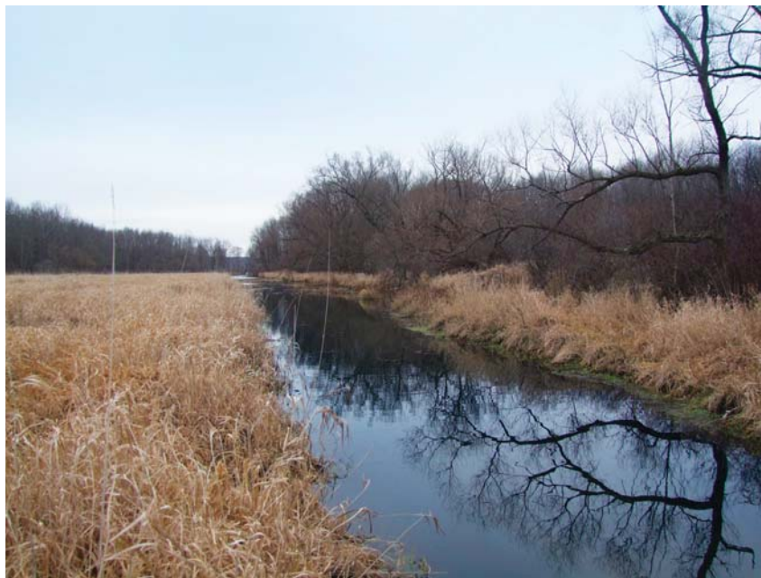
Beaver Creek in Munson, looking north downstream toward Bass Lake

Gauga Park District is also working toward receiving funding through the Water Resource Restoration Sponsor Program (WRRSP). The Park District has been ranked 4th in the state of Ohio for restoration projects for Bass